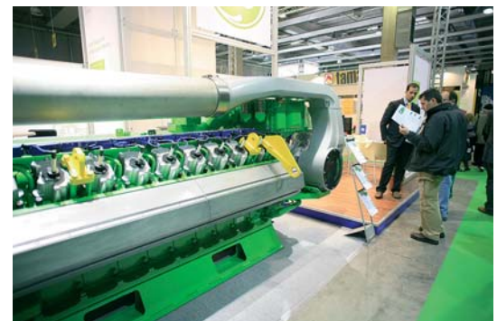
A biogas power generating engine.