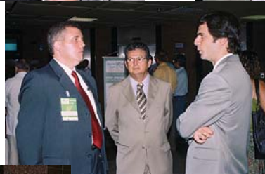
Bahia Government officials