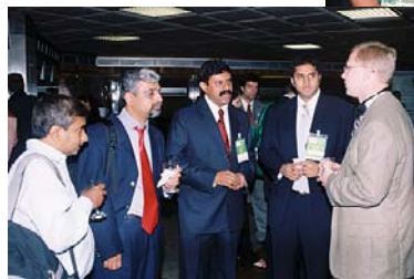
Indian and USA delegates

Partners of Bioenergy World Americas 2006