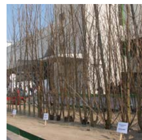
short rotation forestry