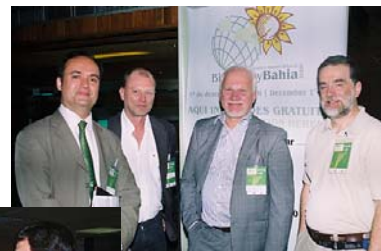
Danish, Swedish and Italian delegates