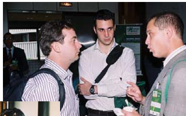
Brazilian and Argentinian delegates

More than 20 countries, spanning 5 continents : Brazil, Chile, Paraguay, Colombia, Ecuador, Argentina, Mexico, France, Italy, Germany, Belgium, Portugal, Spain, Lithuania, Sweden, Denmark, Austria, UK, USA, South Korea, India, Australia, Ghana.